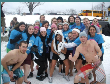
Photo: Polar Plunge 2010.

*Watch your e-mails for upcoming SPTA events that have yet to be announced!