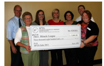
Above: Presentation of the $3800 check to The Miracle League of WNY. Below: Specialized turf field in Grand Island.