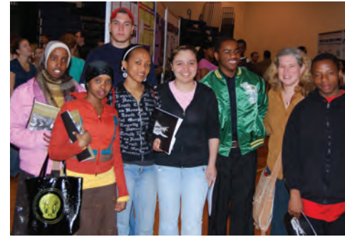
Grover Cleveland Students attend the Daemen College Academic Festival in Spring 2008.

The Center for Sustainable Communities has collaborated with Grover Cleveland High, the Youth Character Development Foundation and the International Institute for the past two years to provide mentoring, training in public speaking, self esteem building and college admissions assistance for international students. Daemen College service learning students worked with these students on reflective essays, financial aid forms, scholarship applications and SAT preparation.