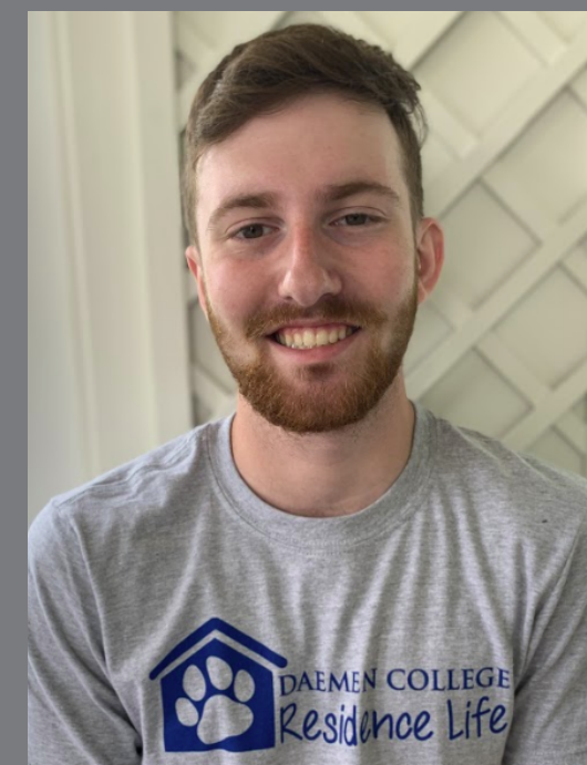
MASON STORM APT 101-14