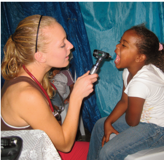
Daemen student providing health-care to villages in the Dominican Republic.

If you love baseball, we also play a lot of it with the local children and visit the local Winter League team during our trip.